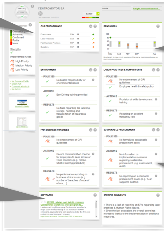
Example of a Premium Scorecard

Benchmark Allows you to compare your performance with other companies in your industry sector [Premium service]